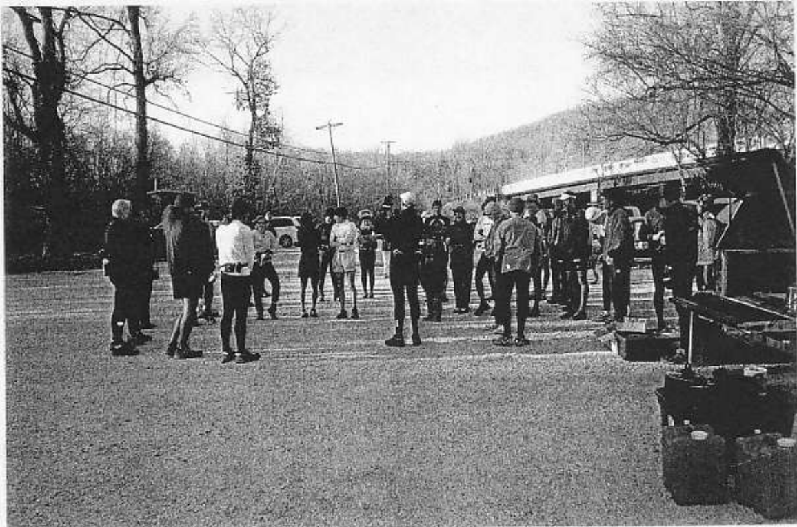
Buffalo River Trail Run Leader, Darin Hoover, gives pre-race instructions at the Ponca low water bridge.