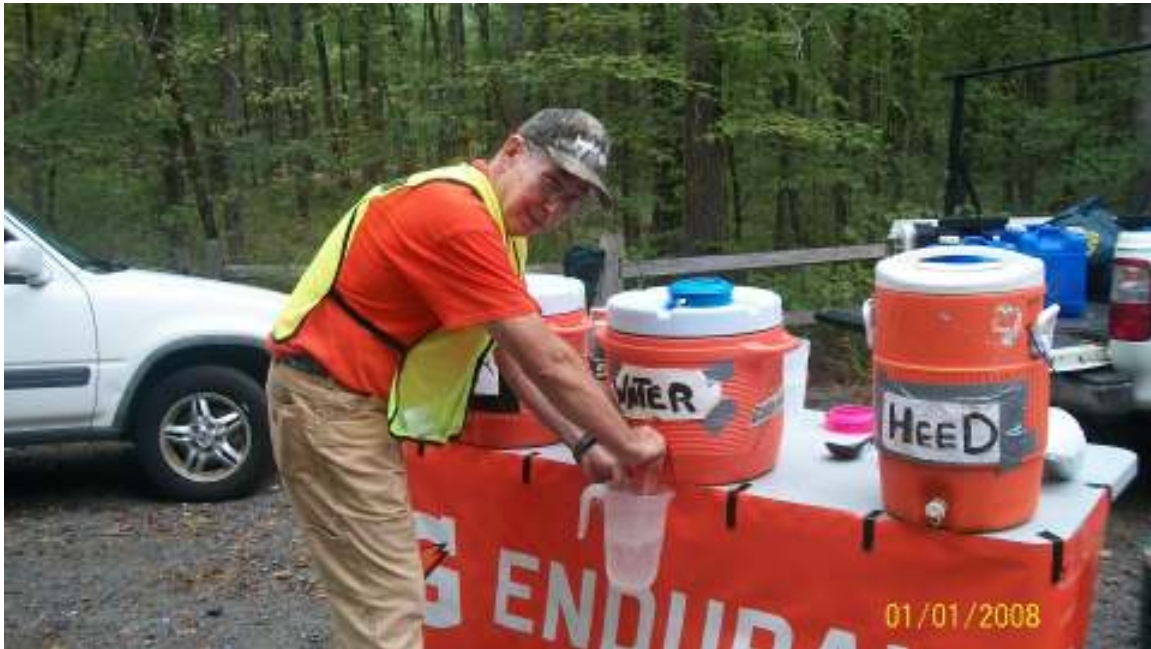
Big Shot filling a water picture at the Lake Sylvania Aid Station